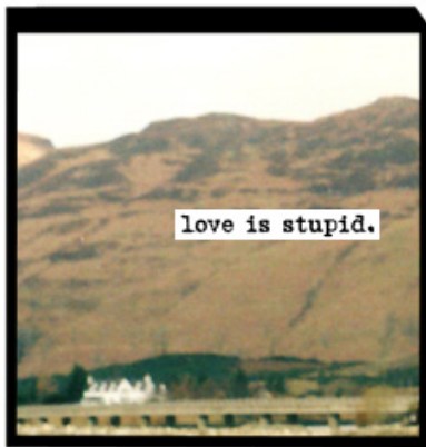
e horne and j comeau